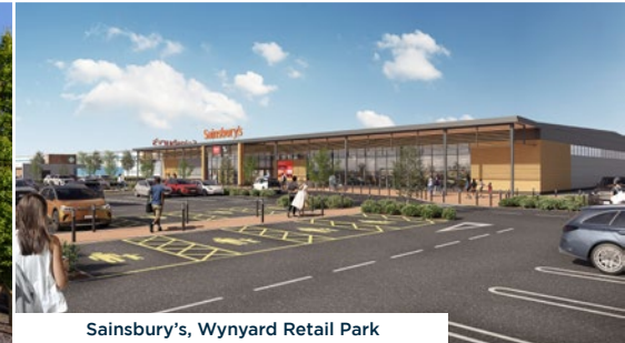
Sainsbury's, Wynyard Retail Park