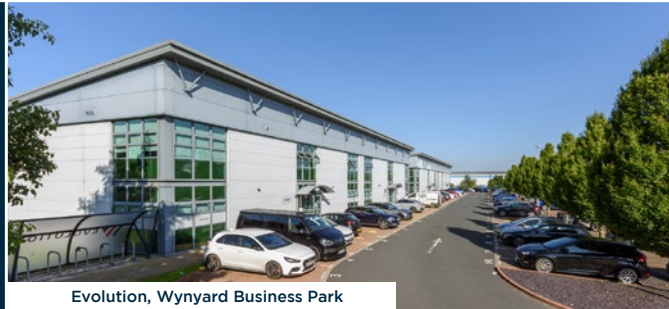
Evolution, Wynyard Business Park

Approximately 1,800 approval/under consideration