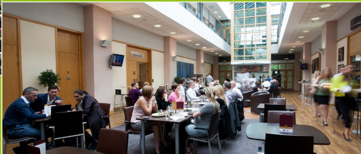
Wynyard Park House, Wynyard Business Park