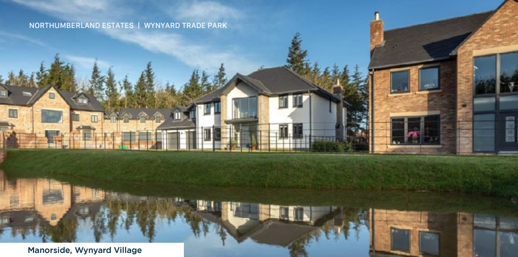
Manorside, Wynyard Village

Population of 500,022 in a 20-minute drive